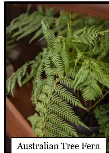
Australian Tree Fern

These are like the plants taken on the SS Great Britain in the 1860s & 1870s!