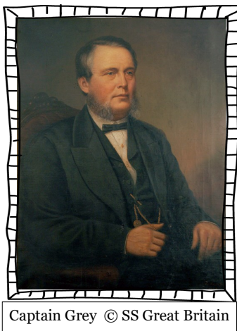
Captain Grey

6) During its lifetime the ship had only six Captains. The longest serving, John Grey, disappeared from the ship mid-voyage in mysterious circumstances on 25 November 1872. To this day, no one knows exactly what happened to him.